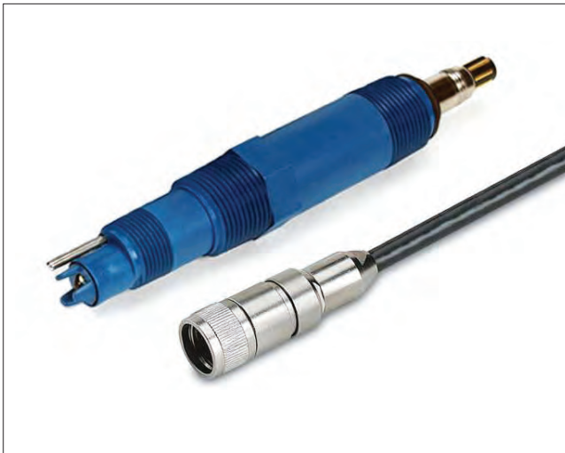
Smart pH sensors have a memory which holds calibration information, so there is no need to carry special equipment out to the field.

Many of the sensors implemented with smart technology also use a special cable-to-sensor VP connector system. This allows for plug-n-play capability so that the user can plug the pre-calibrated sensors into field equipment and the sensor is ready to measure. This is especially advantageous for facilities with remote locations or multiple installations. It also gives the added benefit that the sensors can be rotated in and out of process as needed with minimal downtime. This quick and easy sensor exchange keeps the process up and running.